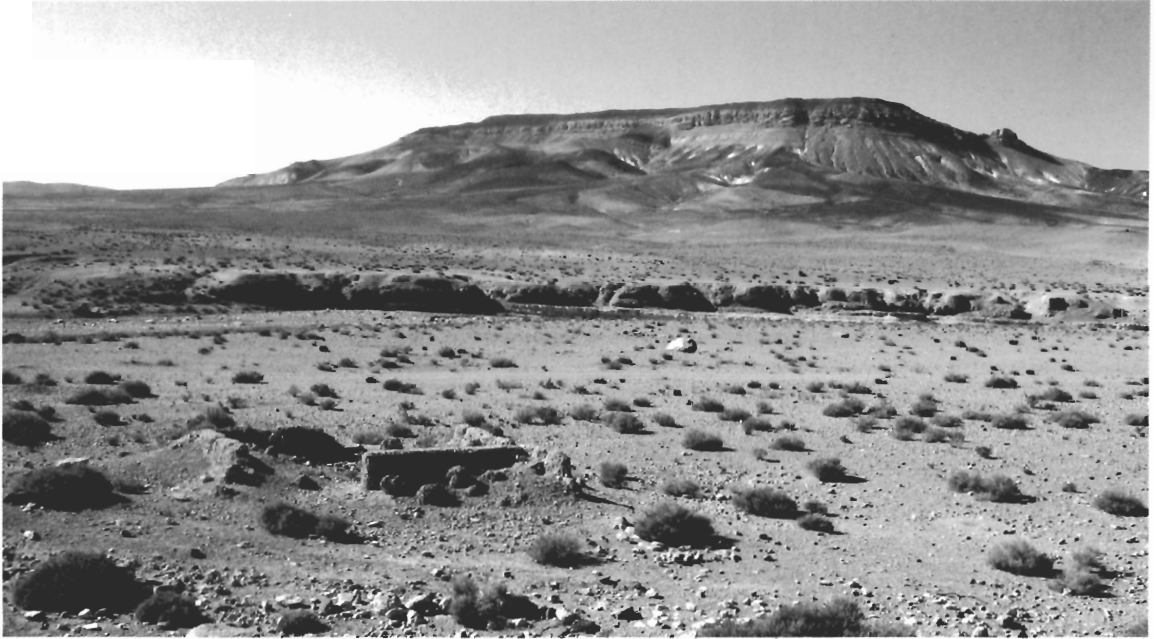
Dans la steppe en venant de Damas, au km 100 avant Palmyre: la “maison de pisé”, ou: dégradation de l’architecture de terre observée chaque année depuis 1989. (Cl. P. Butterlin, 2004).