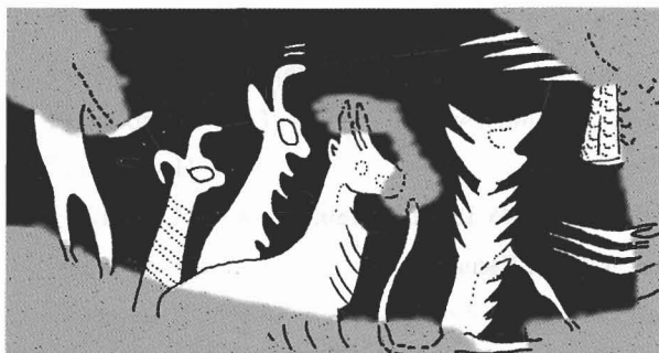
- Fig. 1: Seal Impression from Urkesh with a part of the Etana story (A5q680.1) Drawing by Cecily Hillsdale.