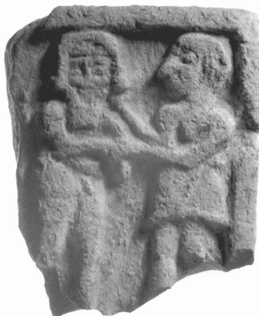
- Fig. 4: Urkesh plaque showing Gilgamesh and Enkidu (?) Photo V9d2501 (A. Abdel-Ghafour)