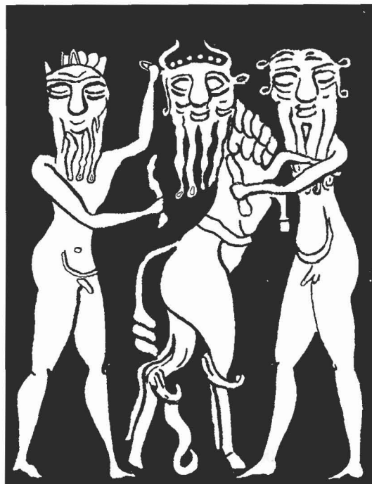
- Fig. 2: The Contest Scene from a seal dated to the period of Lugalanda Adapted from Parrot 1960, Pl. 169B and Amiet 1961, No. 1108.