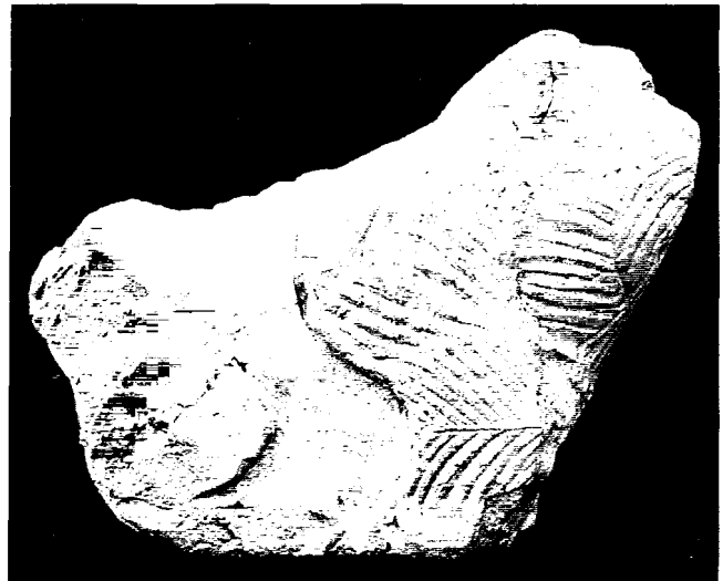
MOZAN, TELL. Figure 3. Small statue of a lion found in temple BA.

Typical Early Dynastic III ceramics include medium jars with grooved rims, Simple-ware conical cups, and Metallic-ware jars with rounded or ring bases. Akkadian ceramics are characterized by a later variety of metallic ware and a con-