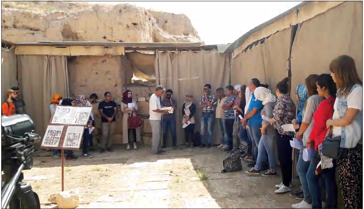
Figure 3. A class on surveying during a two-day workshop at Tell Mozan, September 2017.

the facts regarding the site with scholarly integrity, that gained the full acceptance of the local community involved.