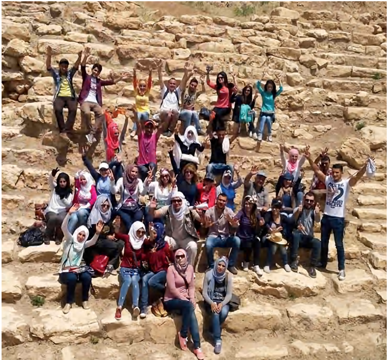
Figure 2. Local university students pose on the monumental staircase during a study trip to Tell Mozan in April 2016.

Of course, we have never been taught to think in terms of community archaeology. Nor did we consciously set out to develop a method. Yet in practice we did. As mentioned above, the steps we took led us to reflect on the work we were doing and in this sense to give shape to the general principles that inspired us as we conducted our project. In articulating them here, we do not refer to an established body of research. We simply describe a personal experience.