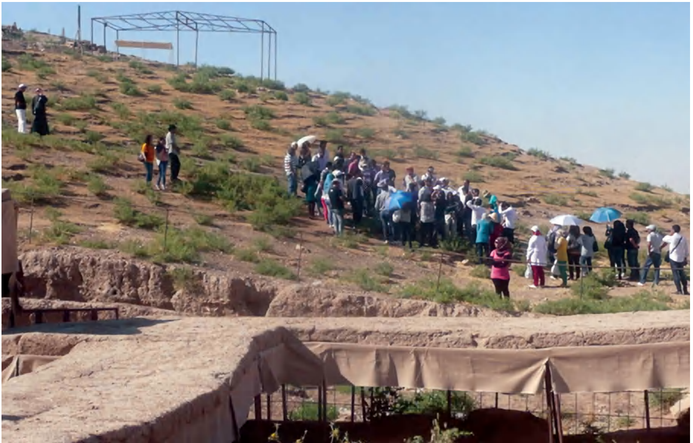
Figure 1. Tourists visit Tell Mozan in April 2015.

A close look at three photographs taken at Tell Mozan is instructive. In succession, we see a group of what we might call lay visitors (the parasols give it away); a group of local university students at the conclusion of a study trip; and a class on surveying, part of a two-day workshop we sponsored for 25 university students. These are different groups engaged in different activities, spending either free or educational time at the site. The dates also tell a tale. These visits all took place at the height of the war. This shows the coherence of a program that has remained fully active for more than six years. During this time, we maintained a very close and direct engagement, even though we could not be physically present at the site. While the war did not affect the site directly, it came close enough—about 60 km (40 miles) away. The main problems at other archaeological sites in the area have been the weather and looting rather than the direct impact of the war. That the architecture at Tell Mozan is in perfect condition, that no vandalism has occurred, and that the signage system still elicits widespread interest is indicative of the success of our efforts. The site's impact on the community throughout this period is the best validation of what community archaeology has come to mean in a very concrete sense.