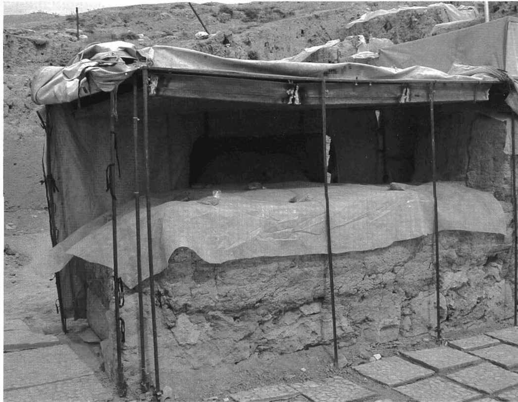
FIGURE 6 Loose plastic cover placed directly on mudbrick, with small sandbags holding it in place, and metal basin at the top to gather water seeping through the tarp (also to hold water in the summer to provide uniform humidity).

bottom of each section, there is a metal bar that also keeps the fabric taut, both when it is in place and when it is lifted.