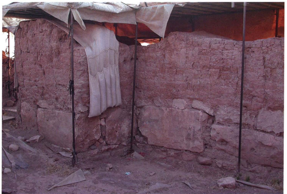
FIGURE 2 Close-up of two walls when covering is lifted.