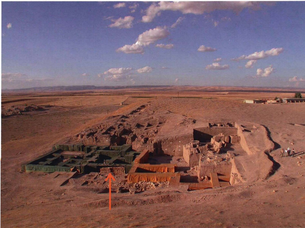
FIGURE 1 Palace with walls covered, and with the canvas covering lifted to show one of the walls.