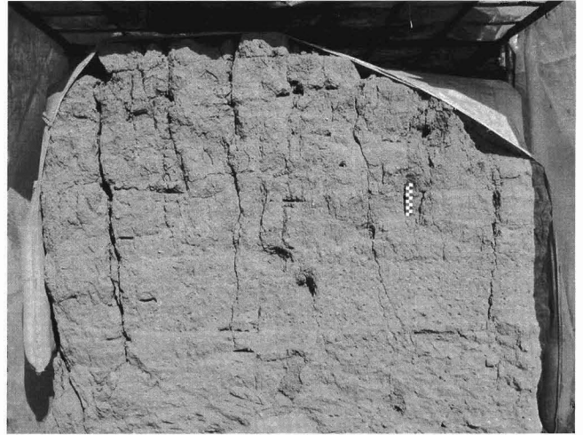
FIGURE 8 Vertical fissures on same wall in 2002, two years after excavations. Note the stretched canvas, weighted down by pockets of sand on either side.

this information in what will continue to be an interesting experiment in professional interaction, in substantive conservation, and in more enlightened archaeology. 1