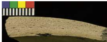
Scanned section (photo # V22q1644)

https://urkesh.org/MZ/A/TCR/TEXTS/A2/ware-ch.htm#phase-5-sherd-illustrations