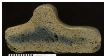
Scanned section (photo # V22q1420)

https://urkesh.org/MZ/A/TCR/TEXTS/C1/Ur3/Ur3-intro.htm