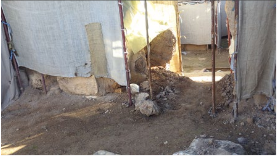
Fig. 5. Damage to doorway C5–C7 (January 3, 2017). This is one of two major losses suffered over the seven years of war