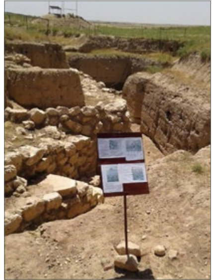
Fig. 10. A stand placed in its proper position at the site (May 2017)