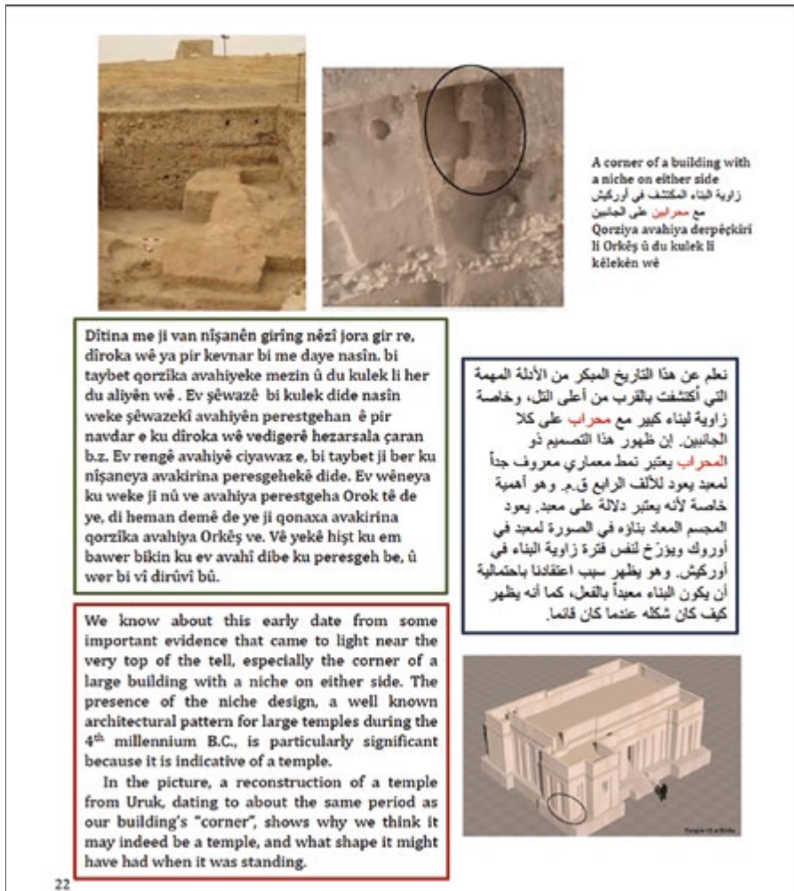
Fig. 13. Two facing pages of the multilingual guide book published in December 2016

If conservation focuses on the materiality of the finds, site presentation focuses on their fruition. It has been my goal since the beginning of the project to have the site be transparent and relevant for visitors. I had in mind the full range of interests, from those of colleagues to occasional guests, adults and children.