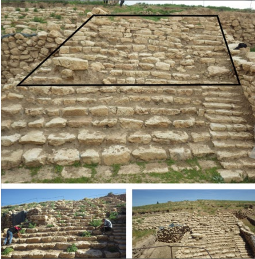
Fig. 1. Monumental staircase in Unit J2: top, after the first cleaning (March 27, 2017). It is interesting to note that the damaged portion of the staircase (in the black frame) is the result not of modern weathering, but of the disuse of the staircase in Mittani times, when the entire lower part of the staircase was covered by rapid accumulations. It is today the way it was first excavated in the 1990s; bottom left, the staircase during the second cleaning (May 5, 2017) and right, after second cleaning (May 7, 2017)

There is no high technology here. But there is a great deal of patience and commitment, especially when you think that this is now the seventh year that the process takes place, without us being present. Just as significant is the fact that we have an ongoing photographic documentation of the process, year by year (fully reported in the Urkesh website). It is what I call a deep loyalty to the site and its