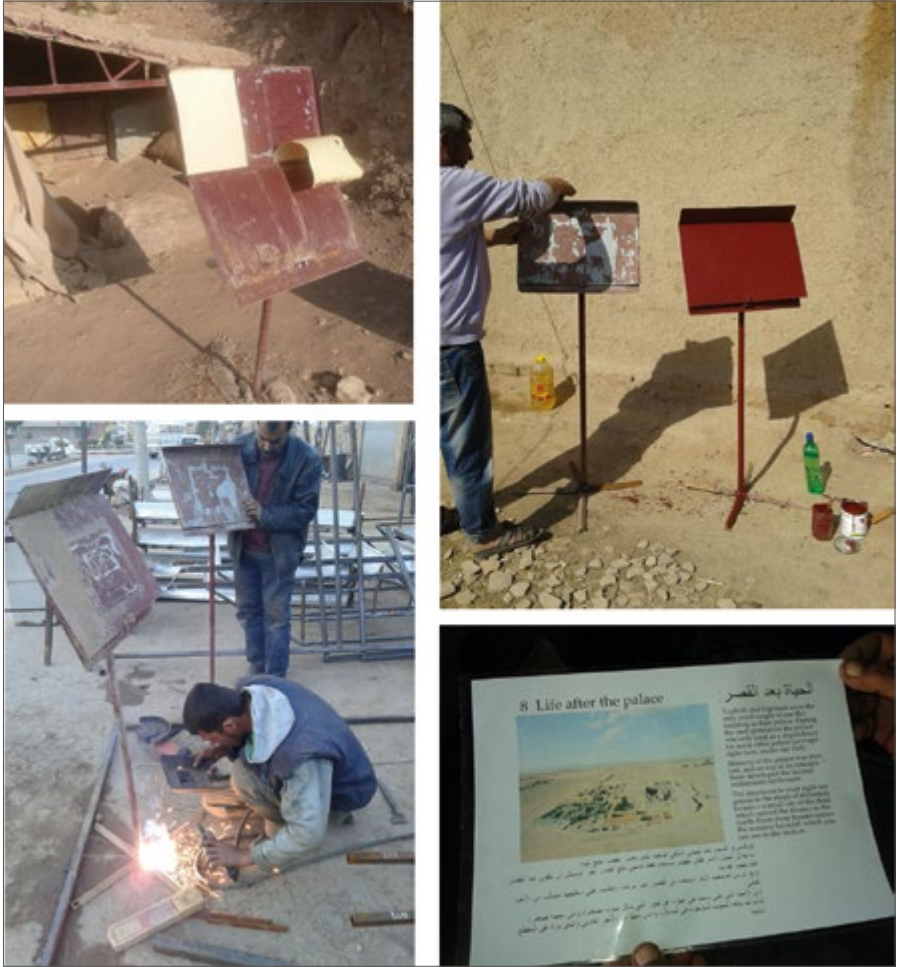
Fig. 8. A damaged “footnote” panel (April 23, 2012). This photo was taken in 2012. At that point I decided to give precedence to the needs of conservation, and we did not repair the signage. The metal stands were taken off the site and stored. Reconstituting the panel stands (February 2017): bottom left, when starting to repair the signage in 2017, the first step was to weld the pieces together: this was done in the neighboring town of Amuda; top right, cleaning and repainting panels (February 2017); bottom right, a laminated page: we had bought a simple laminator that gives strength and durability to the printed pages (February 2017)