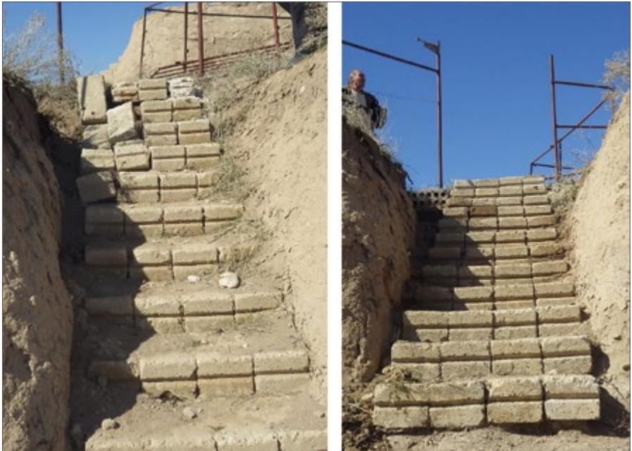
Fig. 11. An access staircase for visitors in its damaged state and after being repaired and cleaned (February 16, 2017)