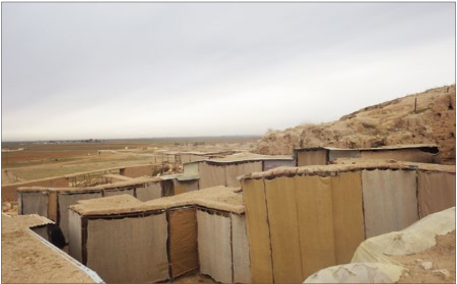
Fig. 6. Overall view of a sector of the Palace AP with old and new curtains (January 18, 2017)