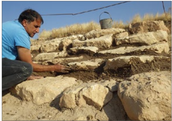
Fig. 2. Gaps between stones filled in with new mud, laid on top of a piece of burlap to keep it separate from the old mud (October 29, 2016) This process takes place in the fall, hence it was not done yet in 2017

The notion of a “perfect state” of conservation needs to be qualified. We did in fact suffer the loss of two wall faces over the seven years of our absence from the site, the second having taken place in the winter of 2016–2017 [Fig. 6].