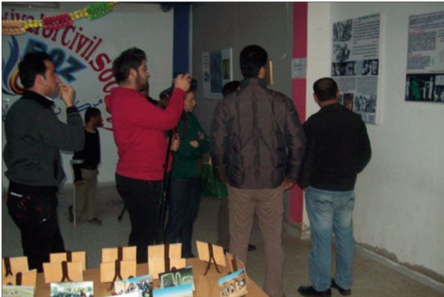
Fig. 14. The Urkesh Exhibit in Amuda, organized by the Subartu association of Qamishli (February 24, 2015)

On the conceptual side, my effort was to provide a very substantive interpretation of the site and of the archaeological process, and at the same time to nurture the local interest. This would start minimally with a sense of curiosity, and would develop and become well founded in the measure in which the substance of the excavation, and even of the archaeological process, could be absorbed and thus appreciated.