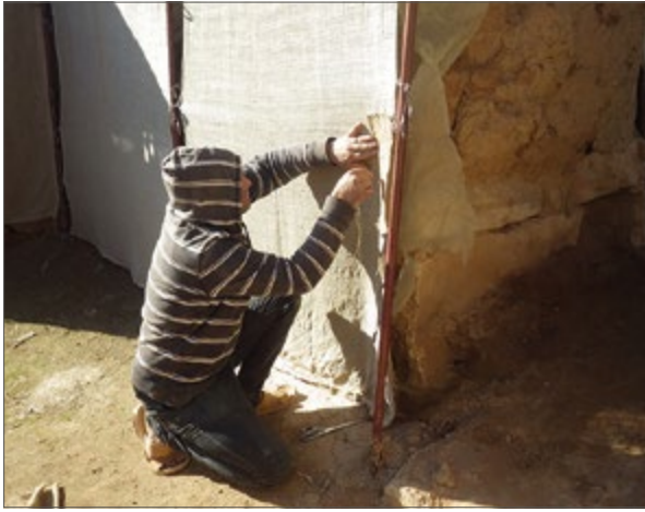
Fig. 3. Patching a curtain (January 7, 2017) (IIMAS – The International Institute for Mesopotamian Area Studies)