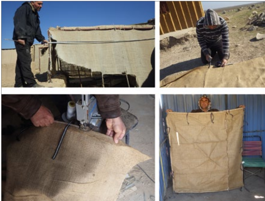
Fig. 4. New curtains being made: top left, taking measurements of a torn curtain to be replaced (January 12, 2017); top right, designing a new curtain (January 14, 2017); bottom left, sewing a new curtain (January 18, 2017); bottom right, a completed curtain before installation (February 2, 2017)