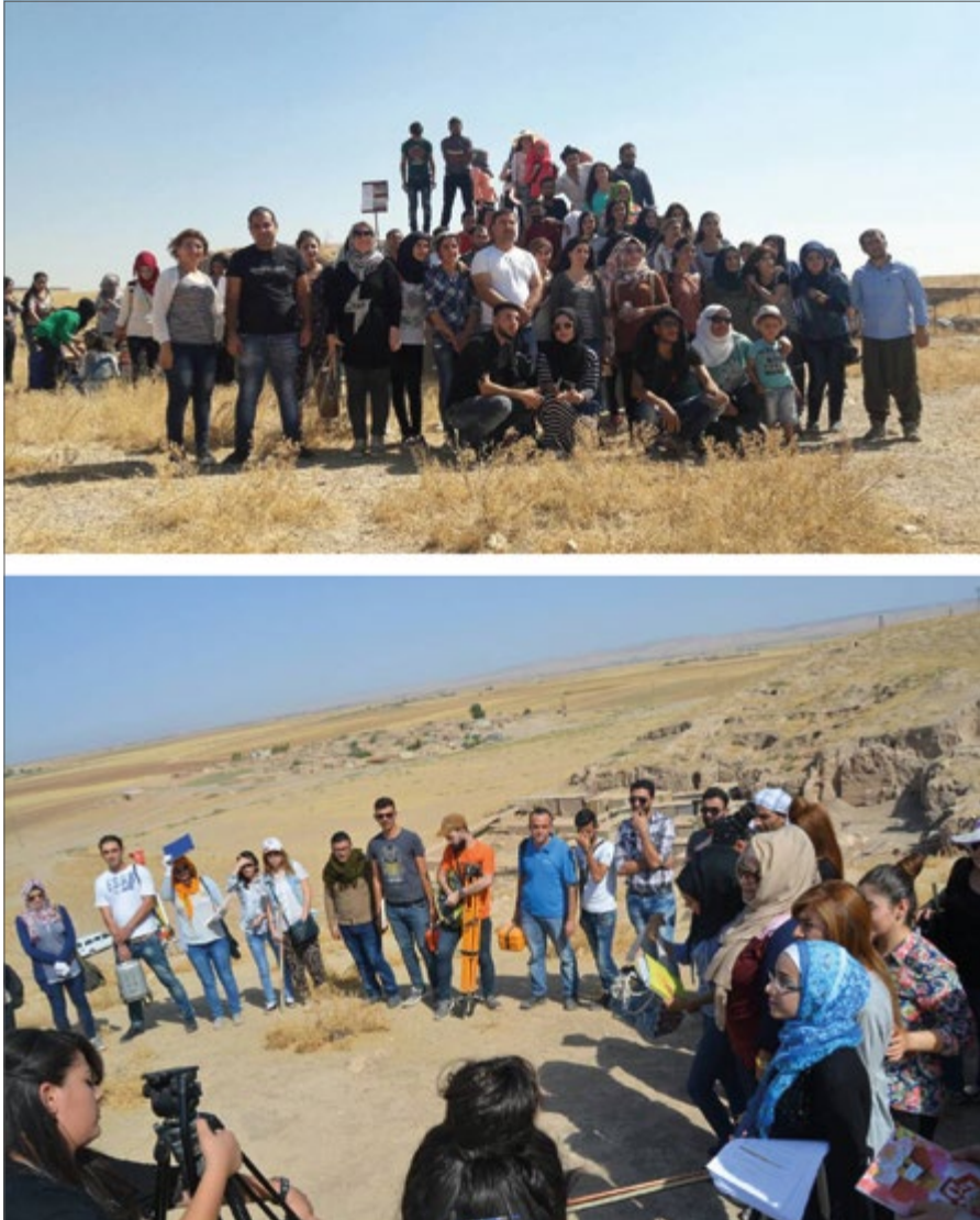
Fig. 12. Families visiting Tell Mozan (August 30, 2017), top, and bottom, a group of students from Al-Furat University at Tell Mozan for a workshop sponsored by the Mozan/Urkesh Archaeological Project (September 5, 2017)