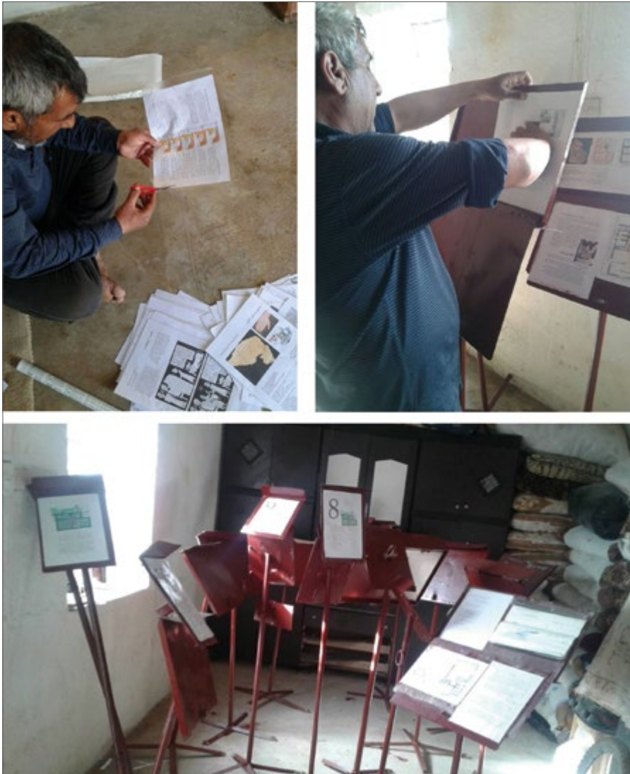
Fig. 9. Top left, preparing the newly printed pages for insertion in the panels (March 2017); top right, gluing the laminated pages onto a stand (March 2017); bottom, the assembled stands ready to be brought to the site (April 2017)