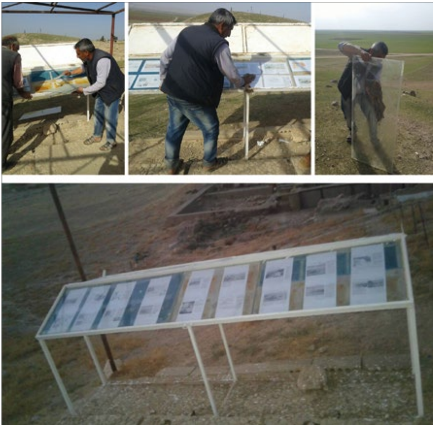
Fig. 7. The “panorama” panels: top from left, removing broken glass (February 2017), cleaning and replacing printed sheets (February 2017), carrying a new glass (February 2017); bottom, the new panorama panel (August 12, 2017)

But, considering that we have about 400 linear meters of mud brick walls, the loss is indeed acceptable. It is contained, and well documented. The excellent condition of the other walls is just as precisely documented in a very extensive section of the Urkesh website (Record > AP Palace > Conservation). This monitoring of the AP palace (which includes a thorough photographic coverage and a daily record of temperature and humidity), started in 2001 at the suggestion of Neville Agnew and Martha Demas of the Getty Conservation Institute and provides the most comprehensive reporting anywhere of a mud brick conservation project – and seven years of this during wartime!