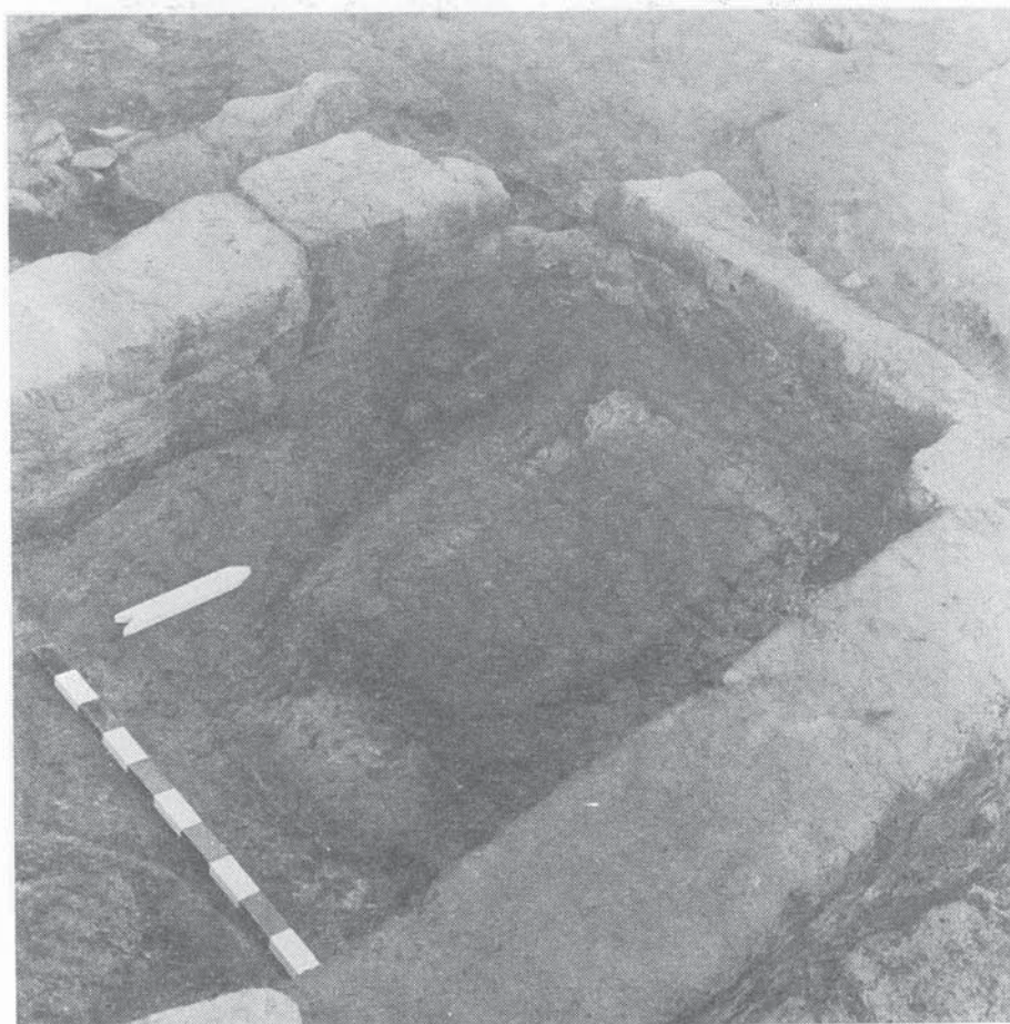
Fig. 1. Room of mud brick house with rectangular hearth at Korucu Tepe near Elâzığ. Early Bronze Age II, toward 2200 B.C.