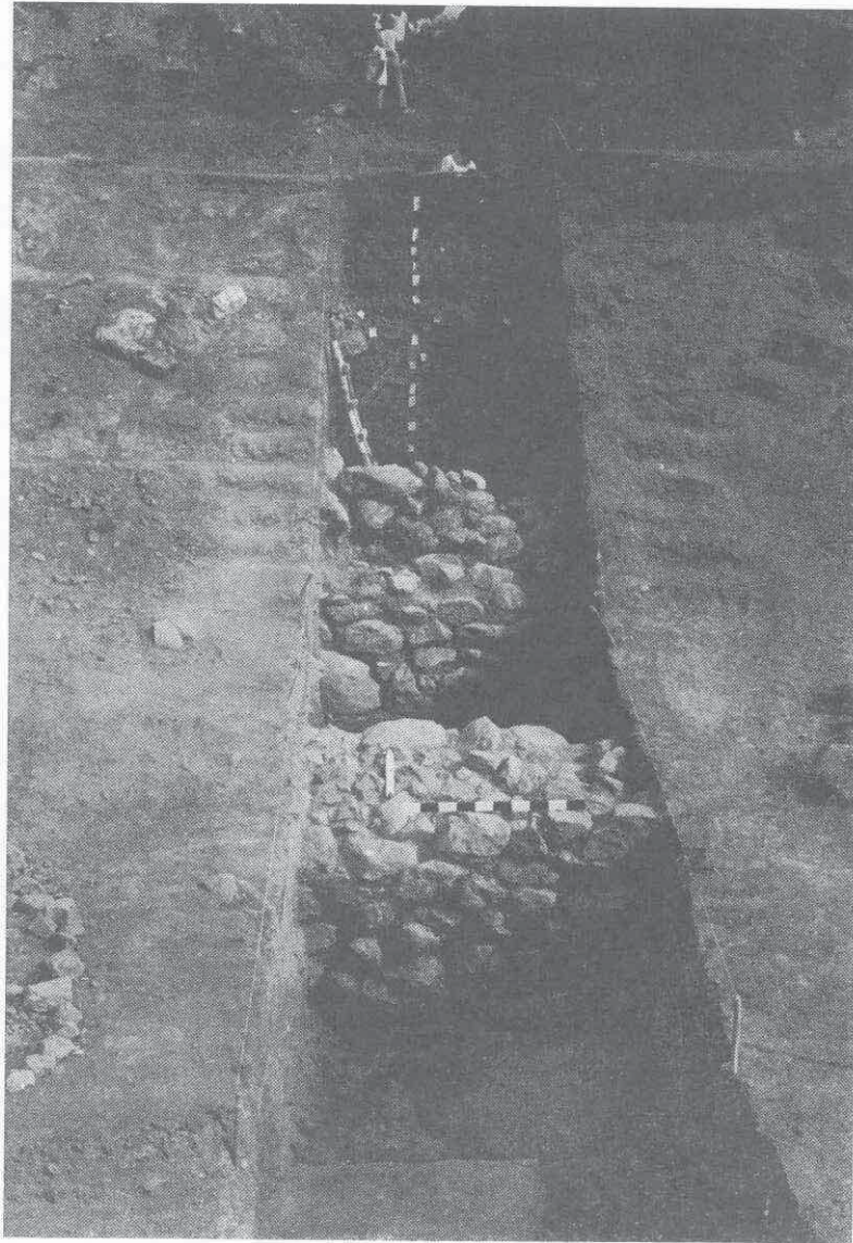
Fig. 3. Double fortification wall foundation, built about 1800 B.C.