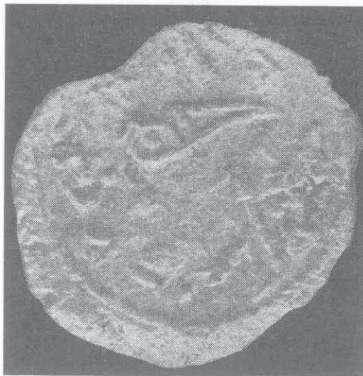
Fig. 4. Hieroglyphic seal impression on conical clay bulla, toward 1200 B.C.